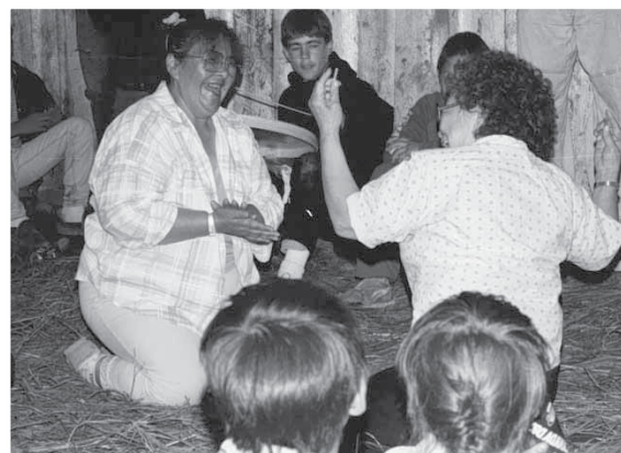
Akhiok ladies play Kaataq.

This simple guessing game requires two inch-long pieces of wood or bone. Although the sticks are the same size, one is marked and the other is plain. The marked stick, called the 'wee,' might be painted, burned on the ends, or grooved. The unmarked stick is the 'dip.'